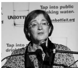
Maude Barlow speaks during "Unbottle It!" event at Market Hall, January 30, 2009